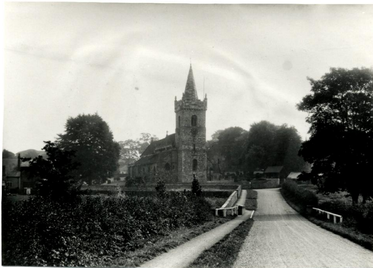
New Road around 1920